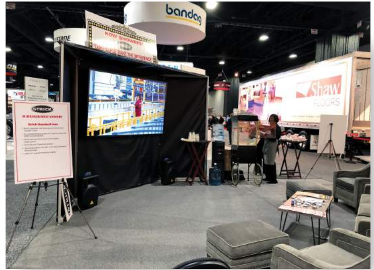
Showcasing “Our People Make the Difference” video highlighting members of the incredible Strick team, testimonials from satisfied customers, and experiencing the inside of our modern, All-American, Indiana manufacturing plant.