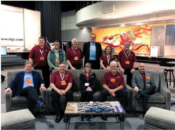
Enthusiastic, creative, and social Strick team members making “Customer-ization” a reality during TMC 2018.